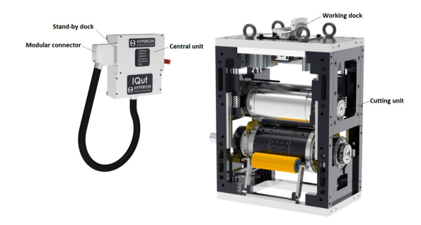
Electronic Central Unit (ECU) the interface which collects all data and communicates with the sensors and PLC or cloud.

Through customer engagement, the Hyperion team found that we needed to meet the needs of both large companies (who may have more dedicated IT services, defined standards for software, data storage and security) as well as small companies (who may have IT implemented by people running the line).