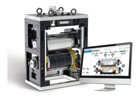
Rotary cutting unit with a view of the monitoring interface.

Working data is not only available for operators, maintenance, and engineering but is also used by managers to drive production.