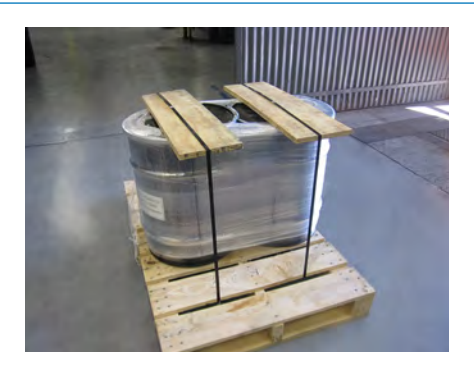
EXAMPLE: 2 DRUMS PER PALLET

- Two wood pieces keep bands from slipping.